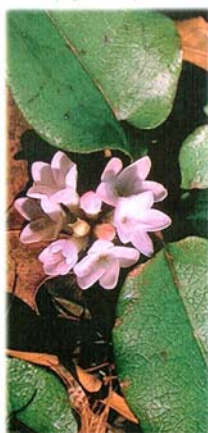
2001 Virginia Wildflower of the Year Virginia Native Plant Society

Massachusetts adopted the Mayflower as its state flower on May 1, 1918.