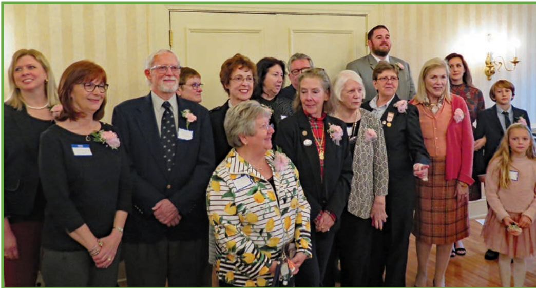
First Time Attendees at 2019 Mayflower Compact Day Luncheon.

The twice-a-year newsletter of the Society of Mayflower Descendants in the Commonwealth of Virginia