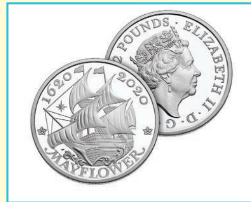
Royal Mint 400th Anniversary of the Mayflower Voyage £2 Silver Coin