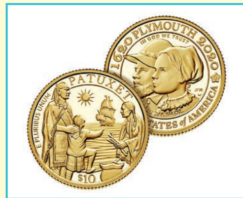
400th Anniversary of the Mayflower Voyage $10 Gold Coin