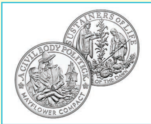
400th Anniversary of the Mayflower Voyage Silver Medal

The $10 gold coin and a silver proof medal are available individually, or the $10 gold coin are each available paired with a coin from the Royal Mint. The US proof medal costs $76.00, and the US gold $10 coin costs $690.00. The Royal Mint is accepting orders for its £2 Mayflower Coin; register to order at https://www.royalmint.com/registration-page/ .