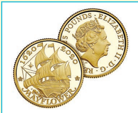
Royal Mint 400th Anniversary of the Mayflower Voyage £25 Gold Coin